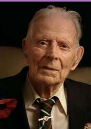
Harry Patch last surviving soldier of WW1

Harry Patch is very anti-war. Are you surprised? Why/why not?