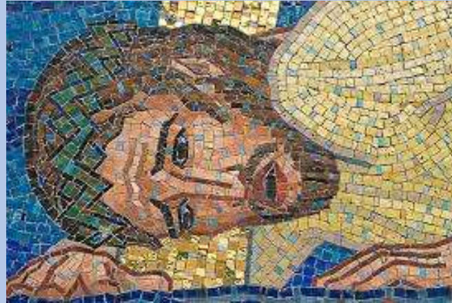
Jesus falls under the weight of his cross